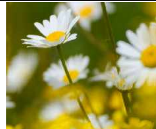
Oxeye daisy

Summer is always a busy time at Fen Drayton Lakes and this year we hope it will be the busiest yet. We are going to have a regular presence on the reserve this summer season and will have lots of activities and events for people of all ages to come and see what is happening and enjoy the birds and other wildlife that live here or are seasonal visitors.