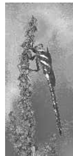
Brown Hawker

The reserve is buzzing with dragonflies and damselflies as I sit here writing this and the bugs, bees, butterflies and other insects are also making the most of the fine weather; there may be the chance of sighting some of the rarer butterflies and dragonflies such as the brown argus or brown hawket over the coming weeks.