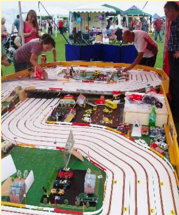
Close-up of the track showing some of the scenarios

The sponsors included Crystal Lakes Leisure Centre and Car Boot Sale, Andy's Cars, CV Diesels/Swavesey Garage, Swavesey Newsagents, KC Manual Solutions, Ashcroft Veterinary Surgery, Rosegate Farm Butchery and the MG Owners Club.